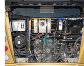
Class leading maintainability.