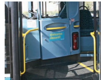
Wide opening, entrance to DDA standard.