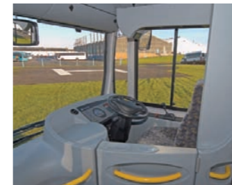
Spacious driver area.