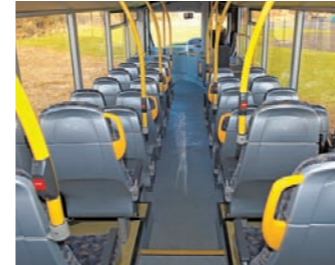
Maximum forward facing seats.